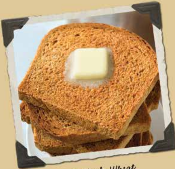
100% Whole Wheat

Sign up at breadsmithMN.com to get regular updates on nutrition and recipe ideas.